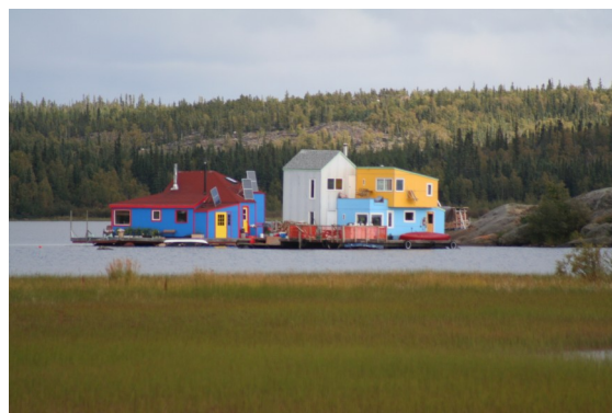
Yellowknife Houses from Hay River exchange